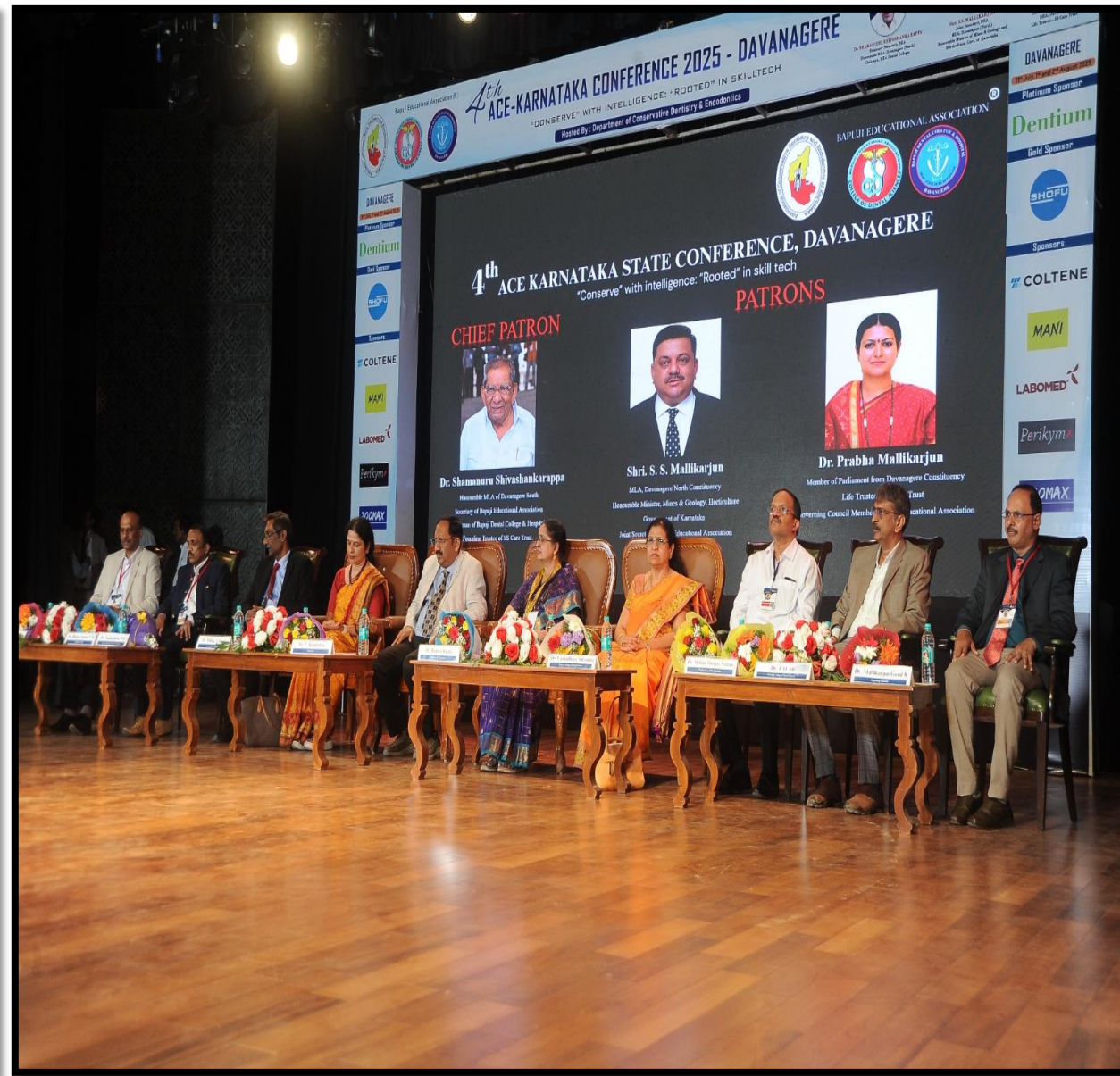
The second day began with keynote lectures by eminent national and international speakers, chaired by distinguished professionals. The Inaugural Ceremony featured a classical dance performance.