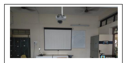
DEPT OF PEDODONTICS