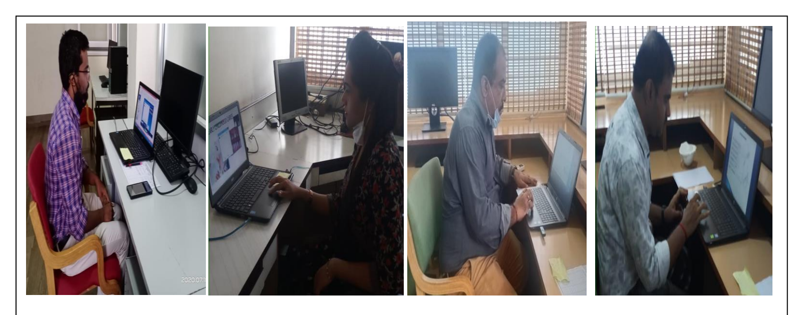
STAFF CONDUCTING VIRTUAL CLASS OVER ONLINE ZOOM PLATFORM