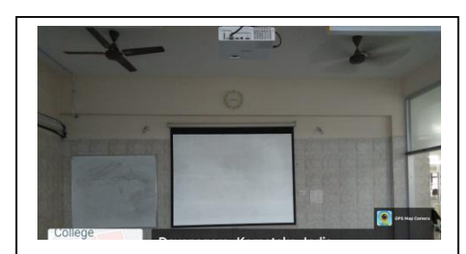
DEPT OF CONSERVATIVE & ENDODONTICS