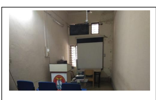
DEPT OF ORAL MEDICINE & RADIOLOGY

Seminar Rooms in the institution: No of rooms:11 No of Projector: 11 No of CCTV: 2