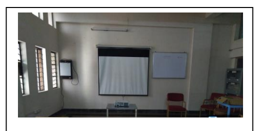
DEPT OF PROSTHODONTICS