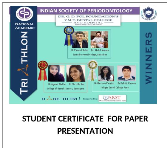
STUDENT CERTIFICATE FOR PAPER PRESENTATION