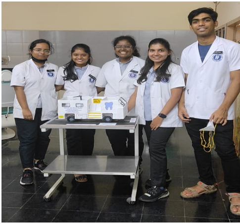
STUDENTS WITH MOBILE DENTAL UNIT MODEL