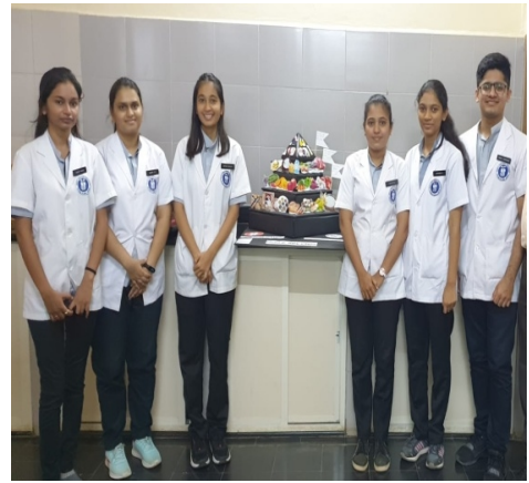
STUDENTS WITH FOOD PYRAMID MODEL