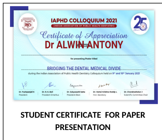
STUDENT CERTIFICATE FOR PAPER PRESENTATION