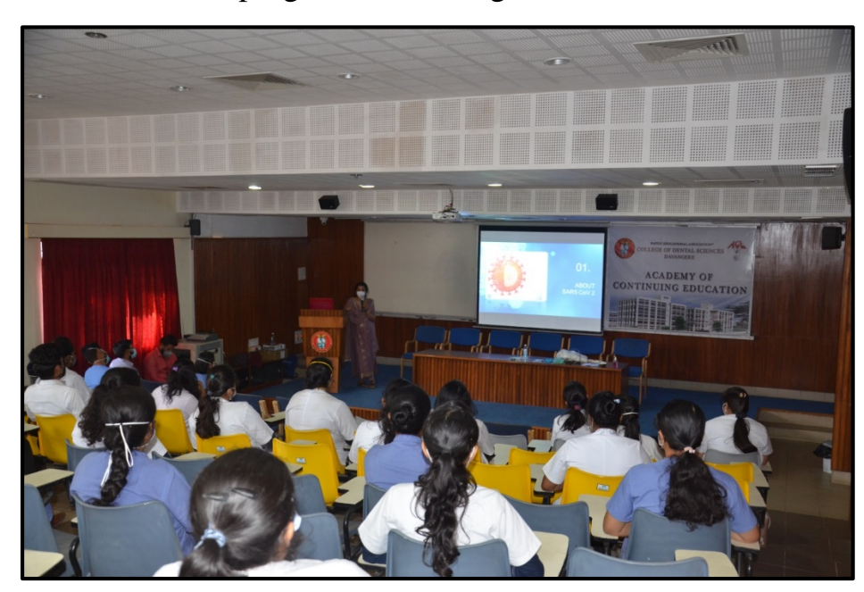
Sensitization program for Undergraduate students on 23/12/2020