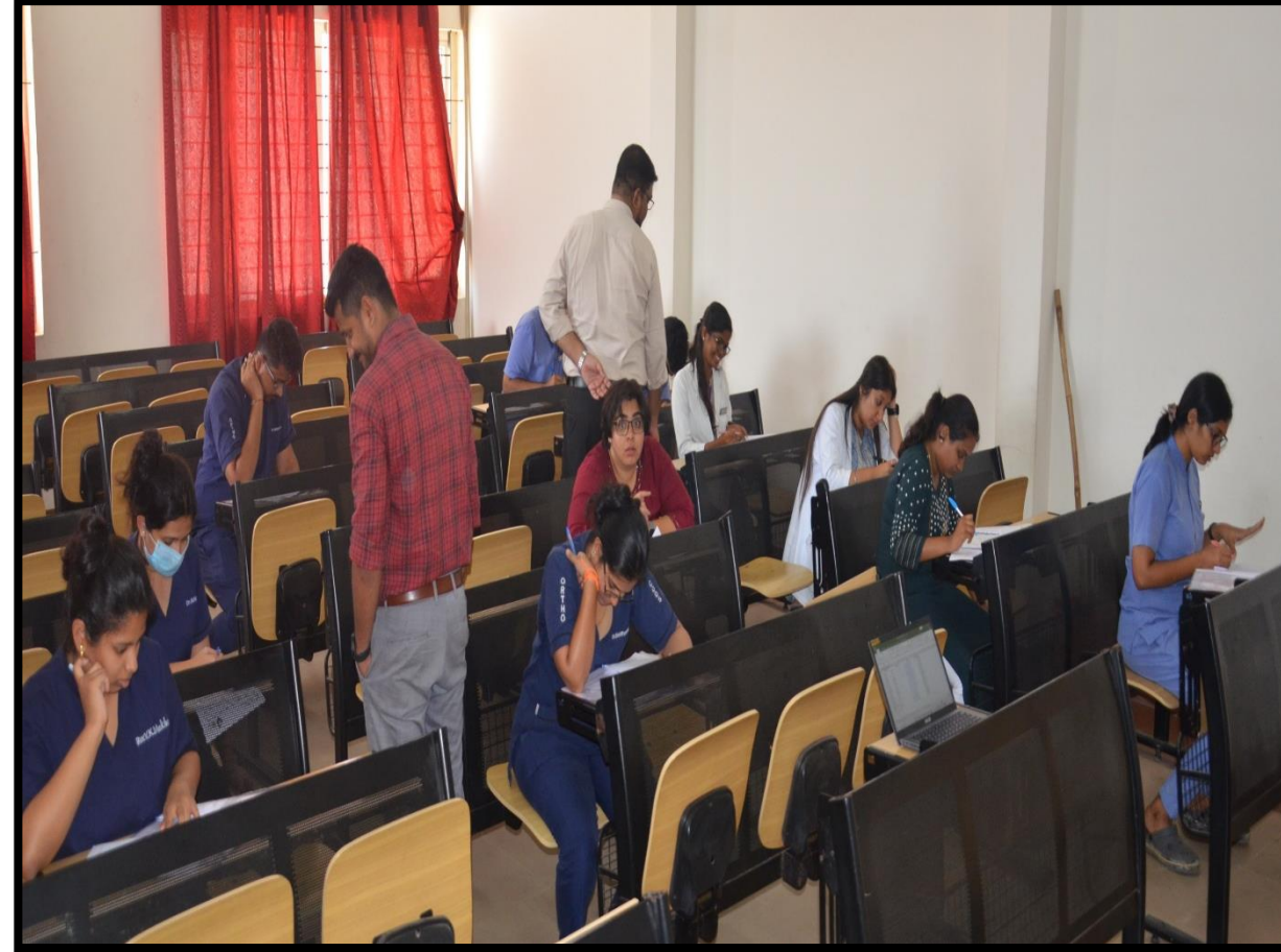
Staff and students undergoing assessment after basic life support training