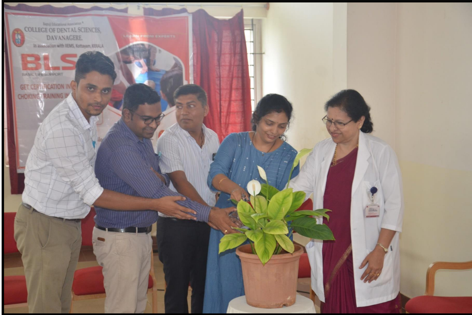
Inauguration of the Course by Dignitaries by watering the Plant