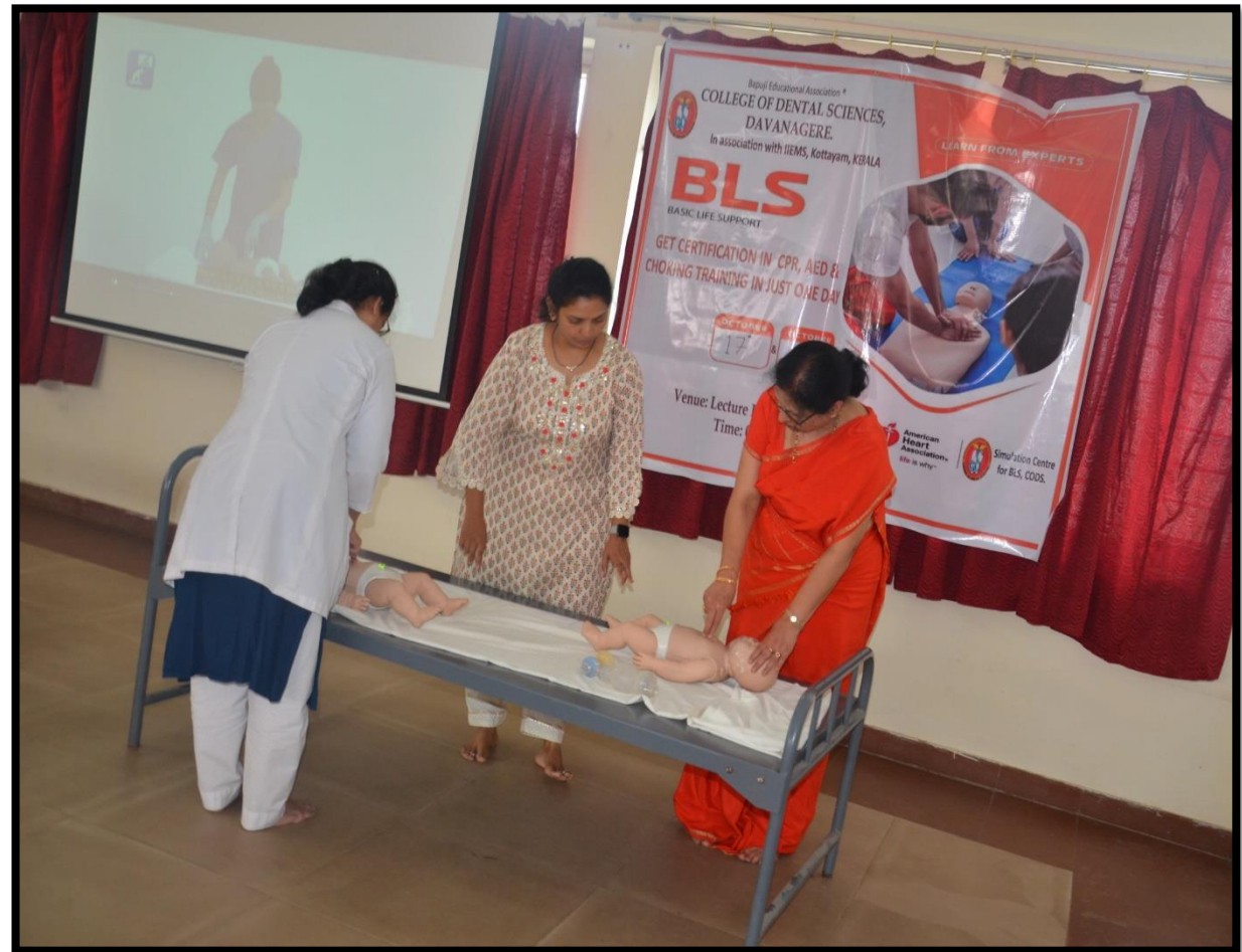
College Staff undergoing training on Basic Life Support