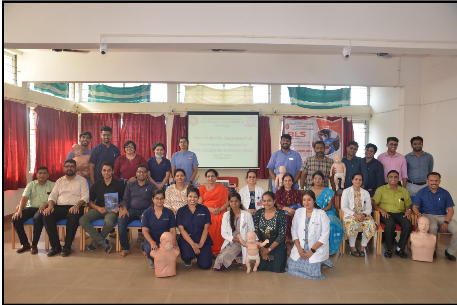
Group photo of participants along with Basic Life support trainers