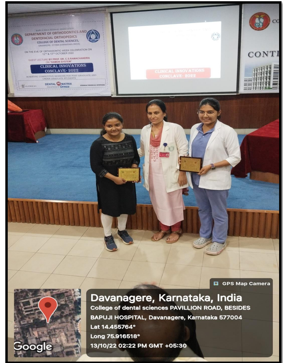
Prize distribution for best poster & paper presentation.