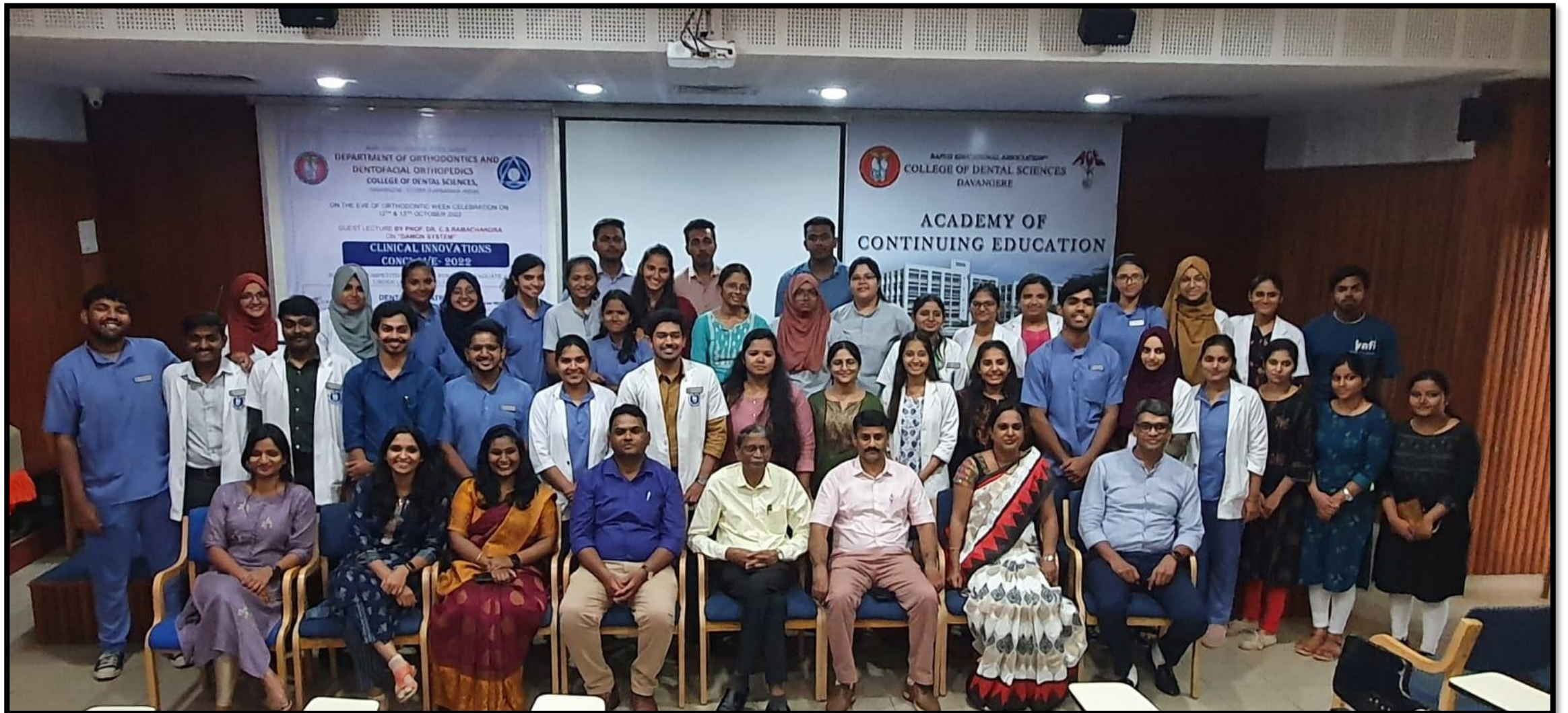
Group photo with staff, under graduates and post graduate students.