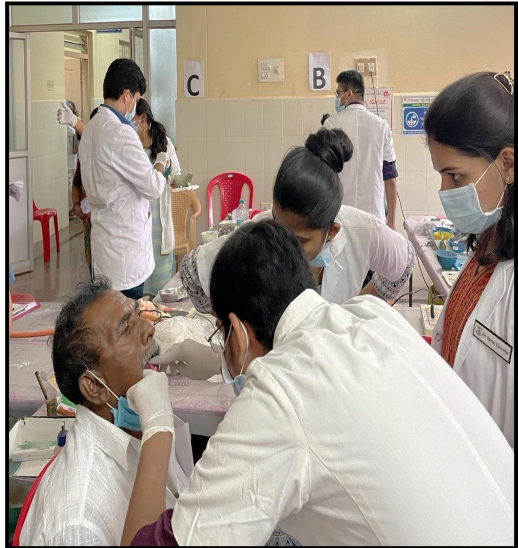
50 beneficiaries (BPL card holders) were treated in the camp with complete dentures.