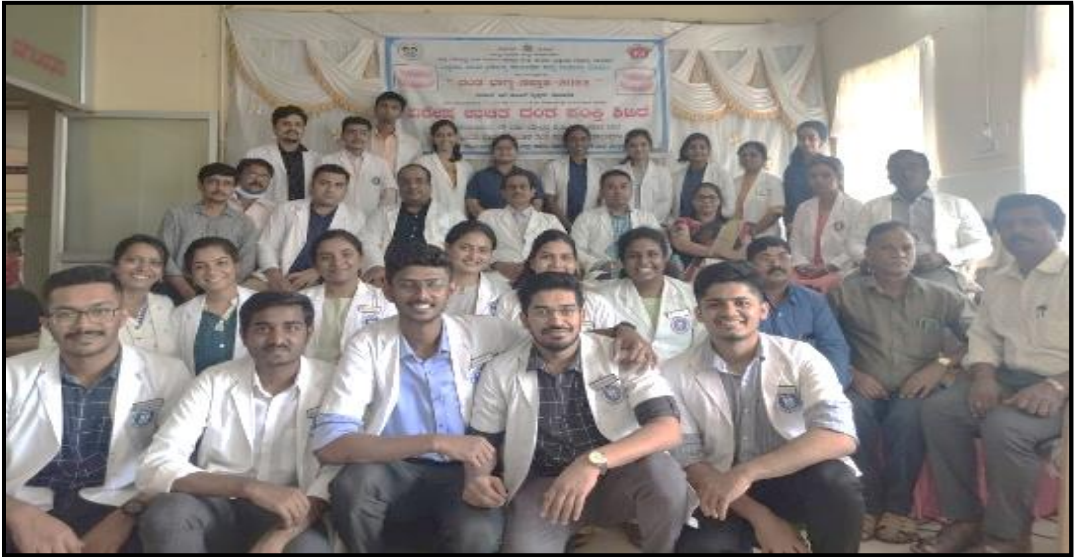
Group photo of Staff, Post graduate students, Interns along with laboratory technicians of college of dental sciences