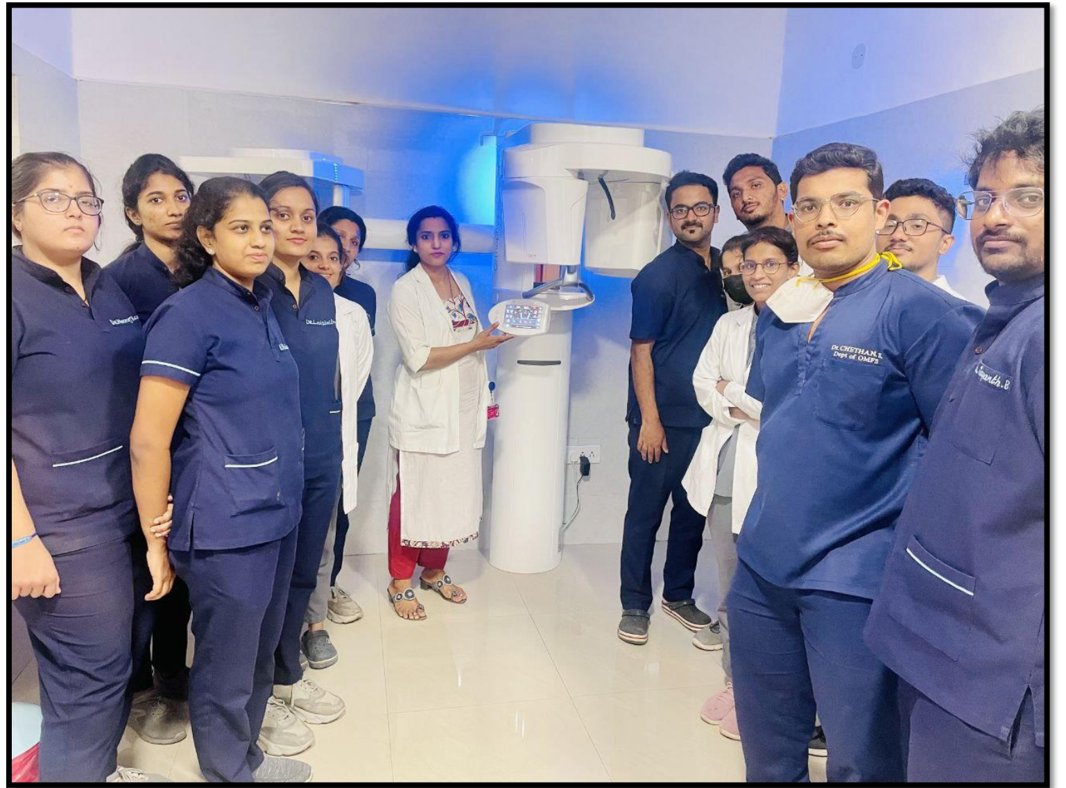
A total of 45 postgraduate students attended the hands on training session