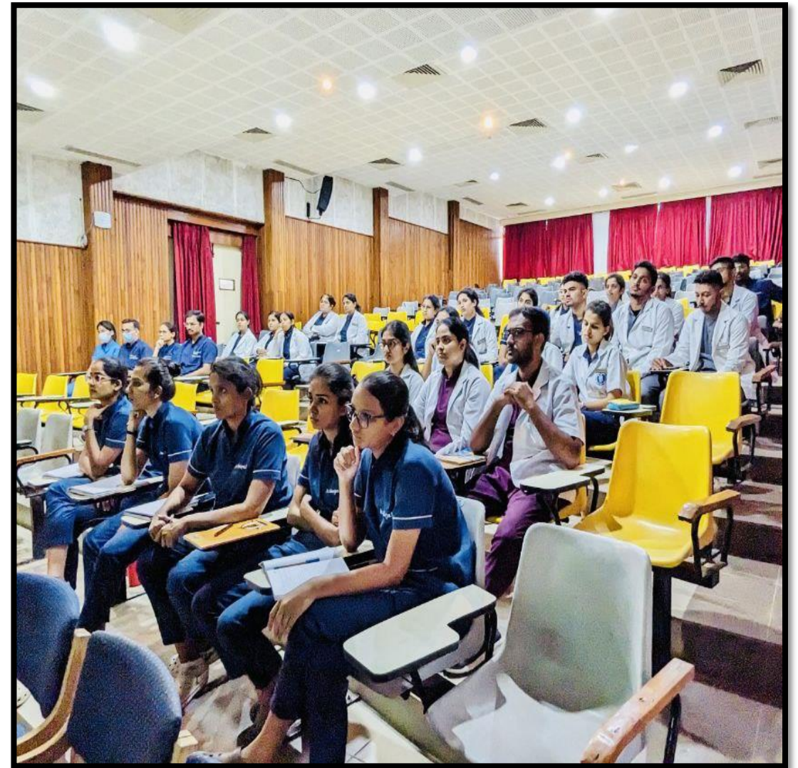
Department of Oral Medicine and Radiology, College of Dental Sciences organized CBCT training program for post graduate students.