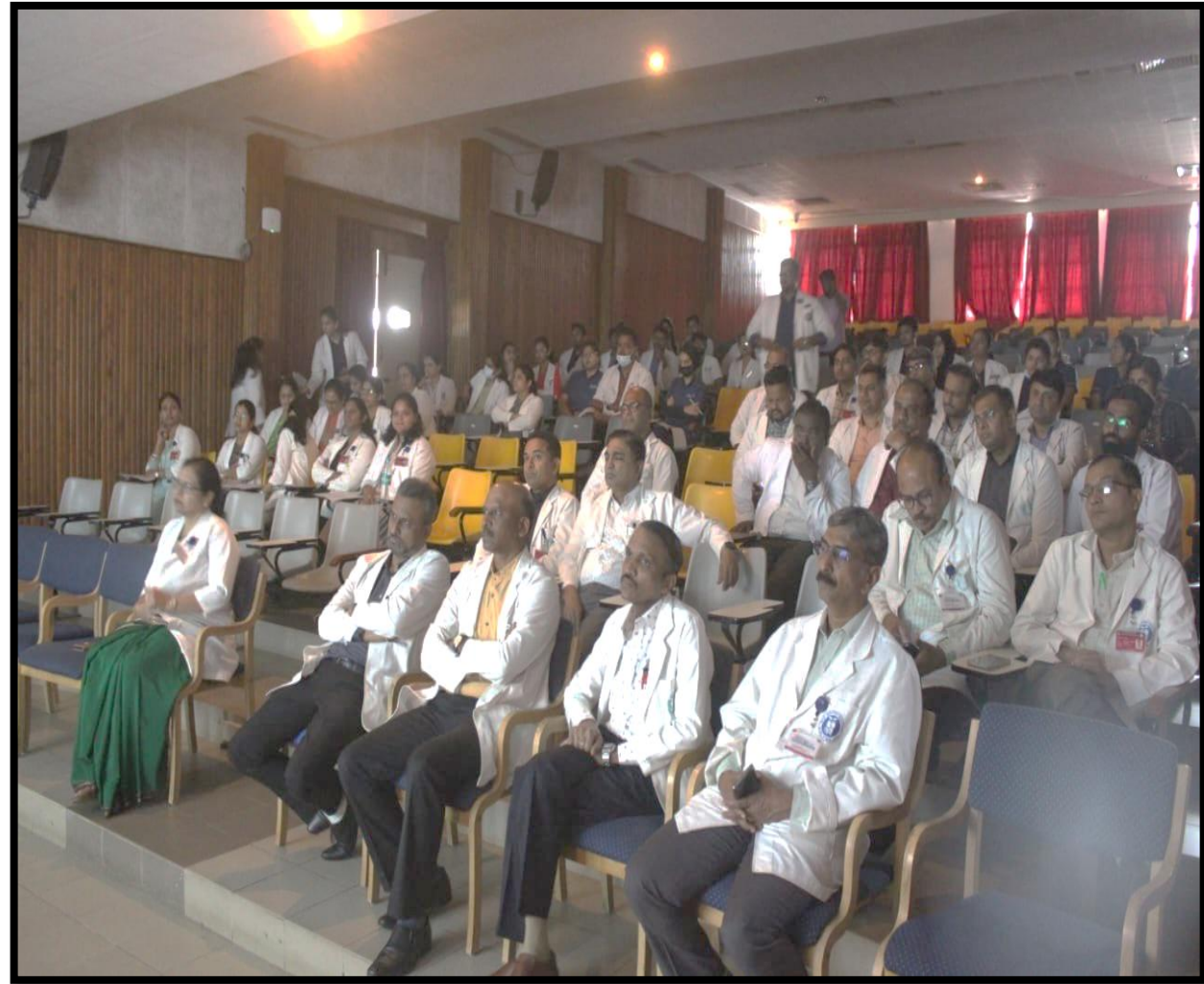
Department of conservative dentistry and endodontics conducted CDE program on the topic "Smile Designing" on September 8th at cods Auditorium.