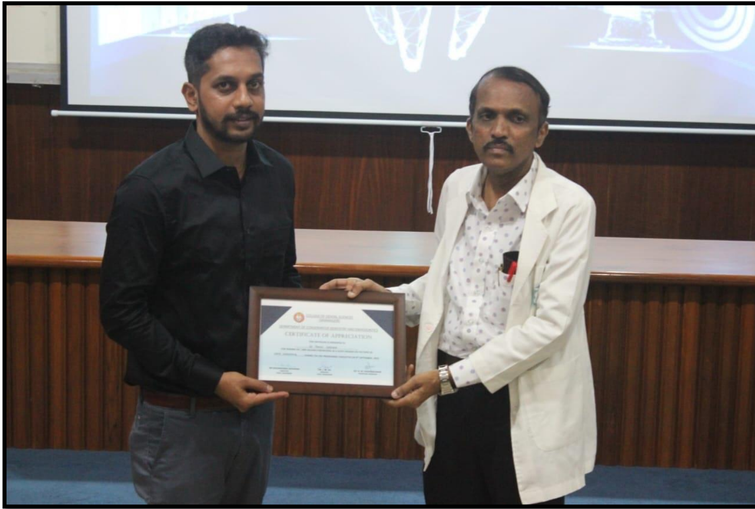
A token of appreciation was presented to the guest speaker