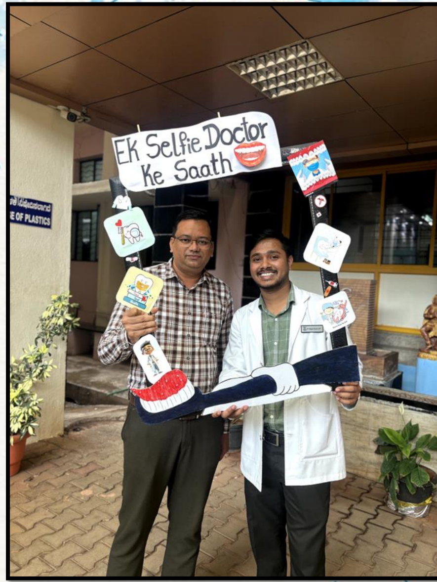
Theme: "Ek Selfie Doctor Ke Saath". A selfie booth was placed in the premises of College of Dental Sciences