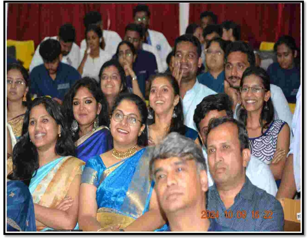
Day 2 (October 8th, 2024):Quiz & Reel Competition on Orthodontic Awareness