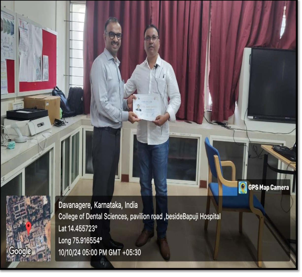
Day 4 (October 10th, 2024): Full-Day Workshop on In-House Aligners