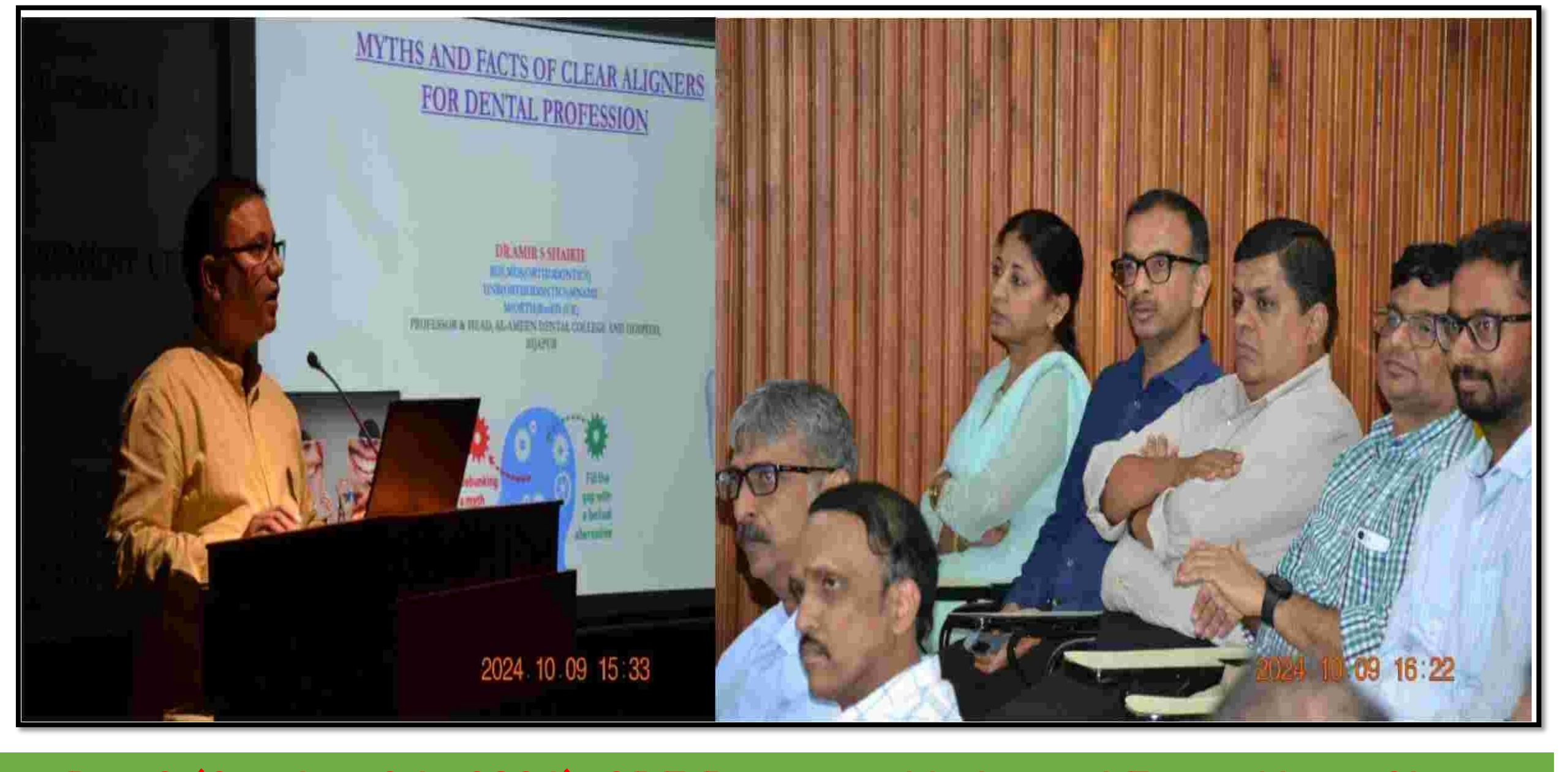
Day 3 (October 9th, 2024): CDE Program: Myths and Facts About Clear Aligners