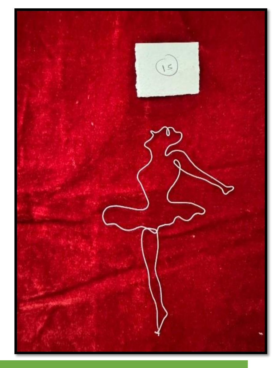
Day 1 (October 7th, 2024): Innovative Wire Bending & Photography